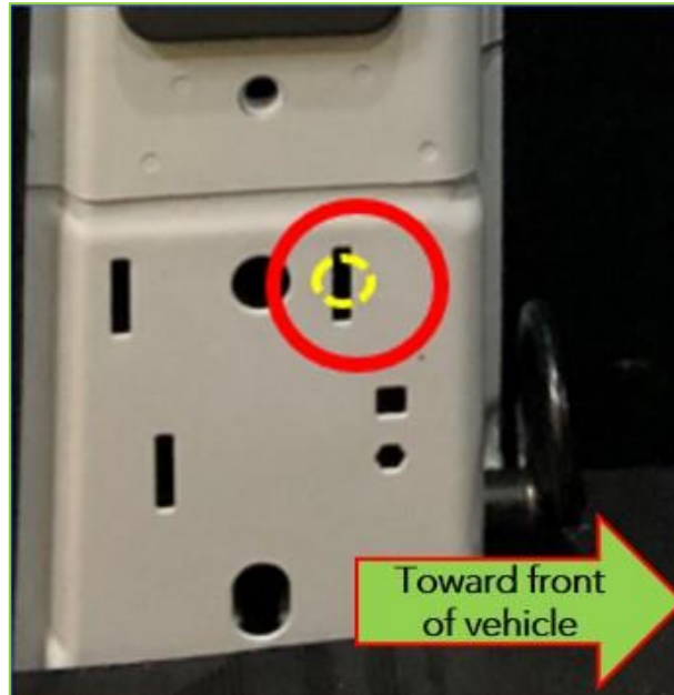
"Identification of slot to be used as Lower Fastening Point"