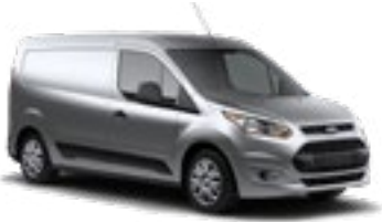
Ford Transit Connect LWB (121")