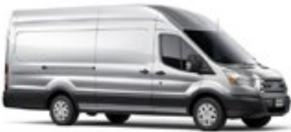
Ford Transit 148" Extended WB