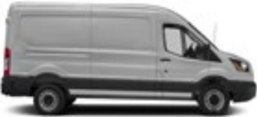
Ford Transit 130" WB