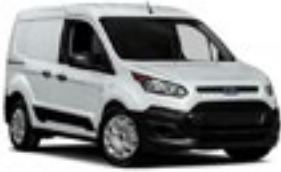
Ford Transit Connect SWB (105")