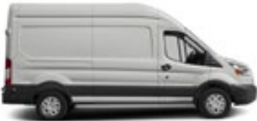
Ford Transit 148" WB